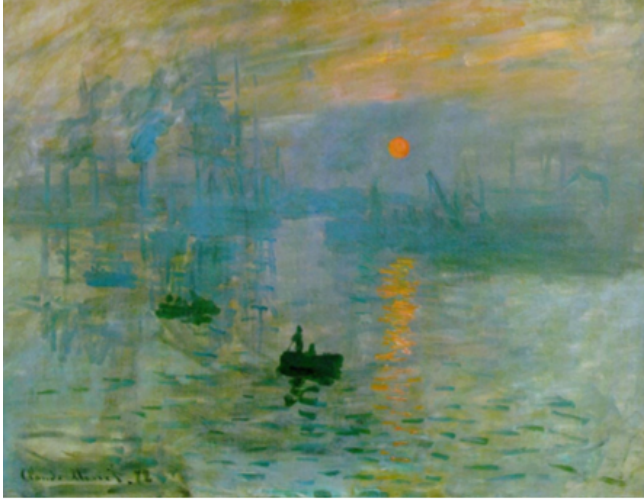
CLAUDE MONET - "Impression, sunrise" (1873) - Paris, Musée Marmottan