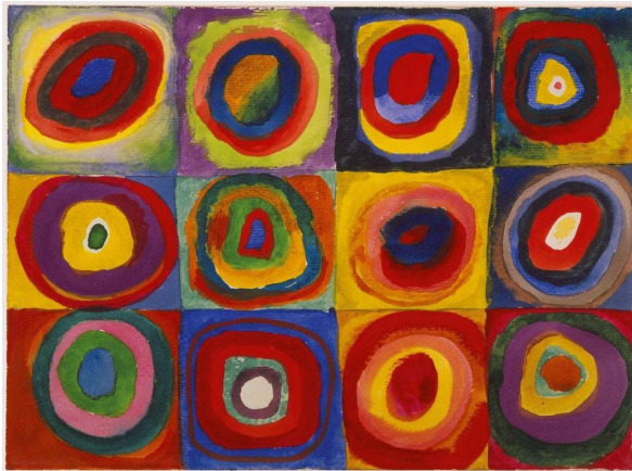
Wassily Kandinsky. Color Study. Squares with Concentric Circles, 1913

2nd Grade Warm Up Cool Colors Smart Notebook with directions: